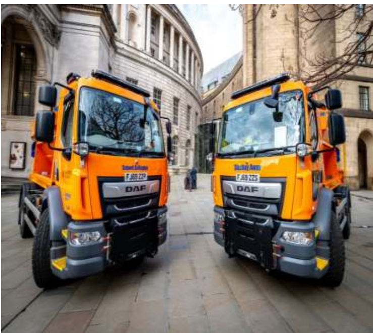
Pictured: Two of the new gritters, Snowel Gallagher and Slushay Away, taken from the Manchester City Council Twitter page.