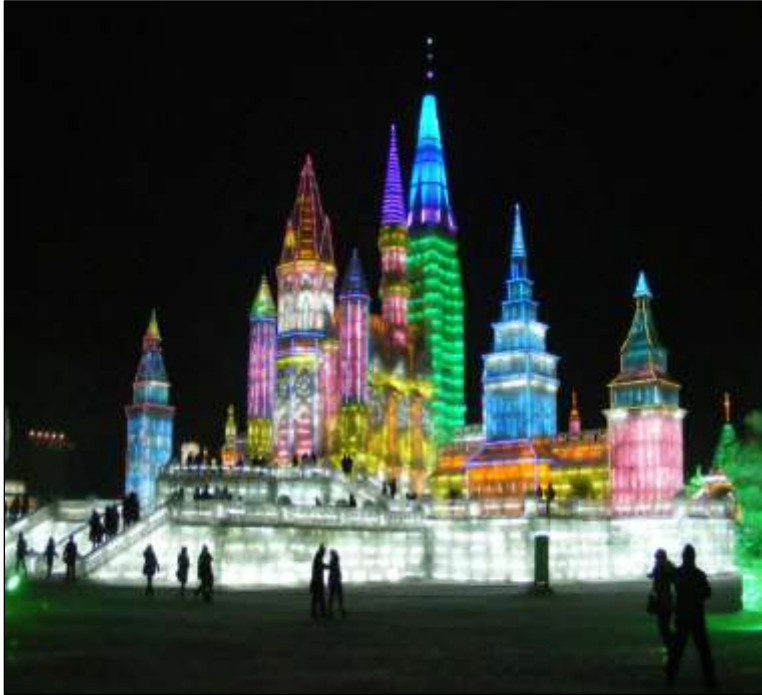
Pictured: Some of the massive, elaborate, colourfully lit ice sculptures on display at the Ice and Snow festival, in 2012, taken by Steve Langguth.

The 36th Harbin International Ice and Snow Sculpture Festival has begun, with fireworks, massive, elaborate, colourfully lit ice sculptures, 43 couples taking part in a "mass ice and snow wedding" and playful penguins. Harbin, in China, is one of the coldest places on Earth and hosts the International Ice and Snow Sculpture Festival. "The world's largest winter festival" inspired by a local ice lantern tradition, starts in January and typically stays up for several months. It attracts up to 15 million visitors every year. The amazing sculpture show takes over a massive 600,000-square-metre space. The tallest sculpture in the display is over 45 metres tall. To complete all this art, 10,000 workers were needed to cut, haul, and sculpt 170,000 cubic metres of ice!